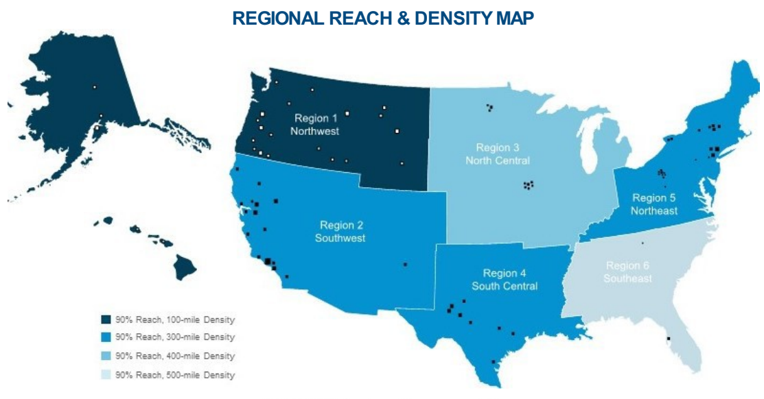
2020 US Region Revenue Mix

We are one of the largest automotive franchises in the United States and were ranked #252 on the Fortune 500 in 2020. As of February 19, 2021, we offered 33 brands of new vehicles and all brands of used vehicles in 210 stores in the United States and online at over 200 websites. We offer a wide range of products and services including new and used vehicles, finance and insurance products and automotive repair and maintenance.